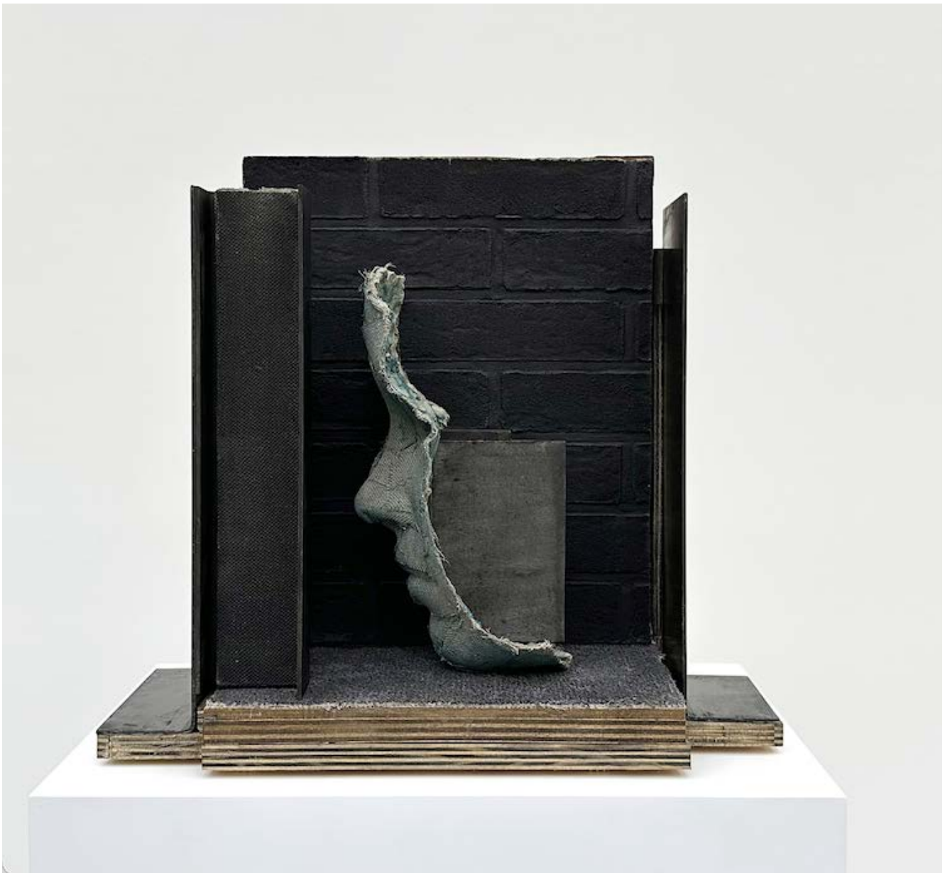
Mark Manders, Night Scene , 2023. Painted canvas, painted ceramic bricks, painted wood, iron. Courtesy Tanya Bonakdar Gallery