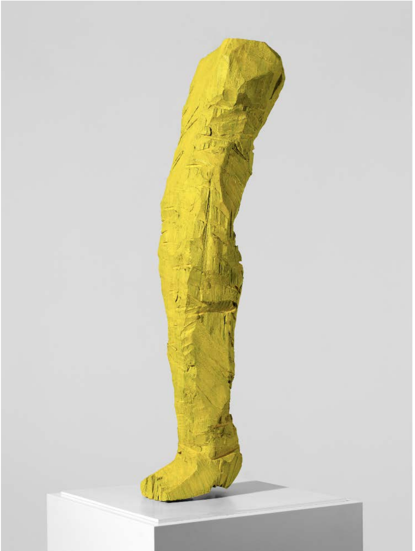
Georg Baselitz, Gelbes Bein/Yellow Leg, 1993-2021. Patinated bronze and oil color. Edition of 9.