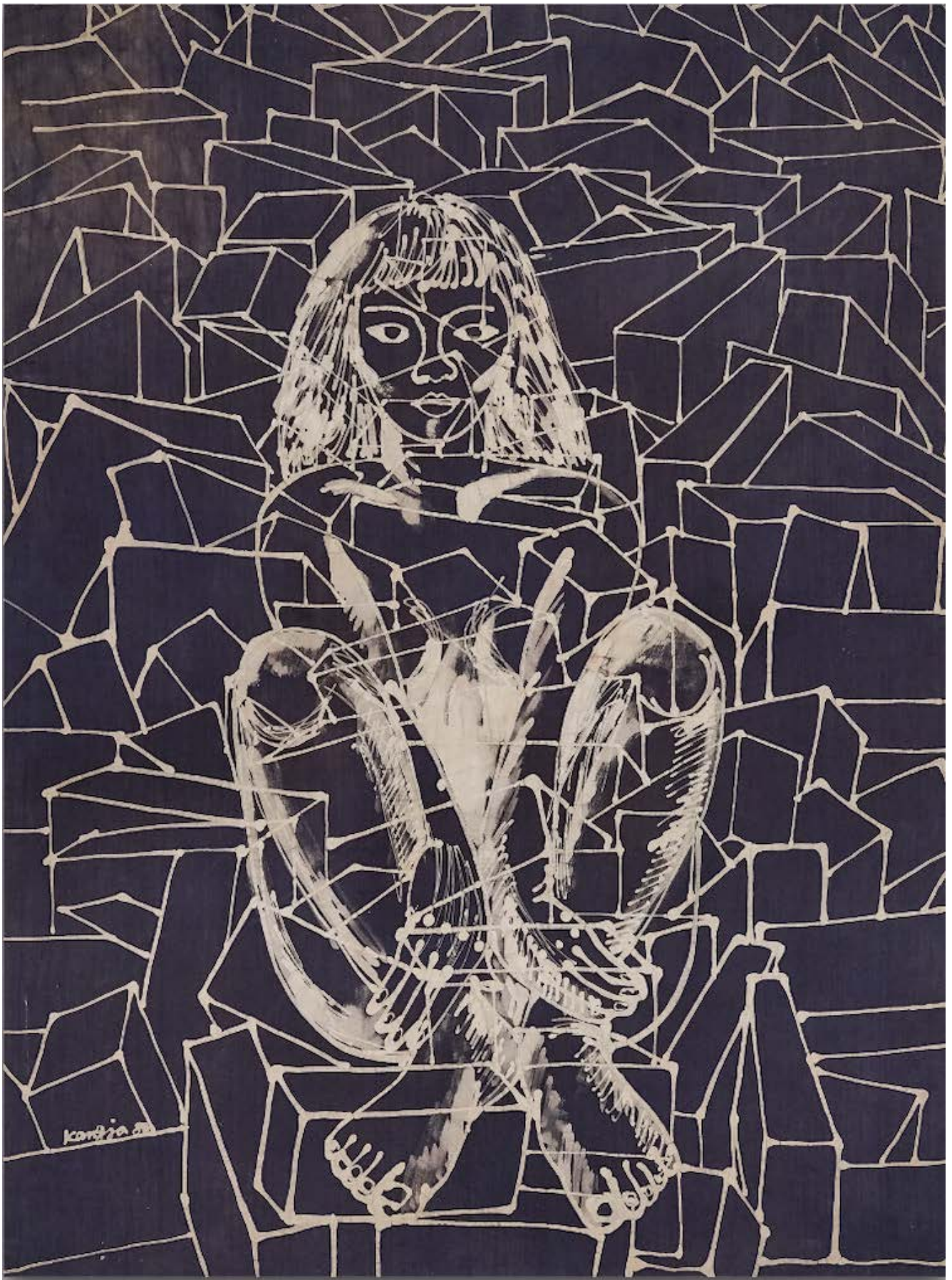
Kangja Jung, Untitled, 1980. Wax-resist dyeing on cloth (Batik Painting).