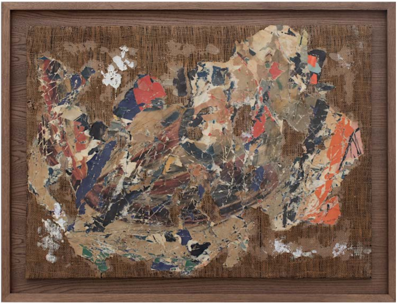
Mimmo Rotella, Buon Compleanno, 1955. Mixed paper and paint on jute.