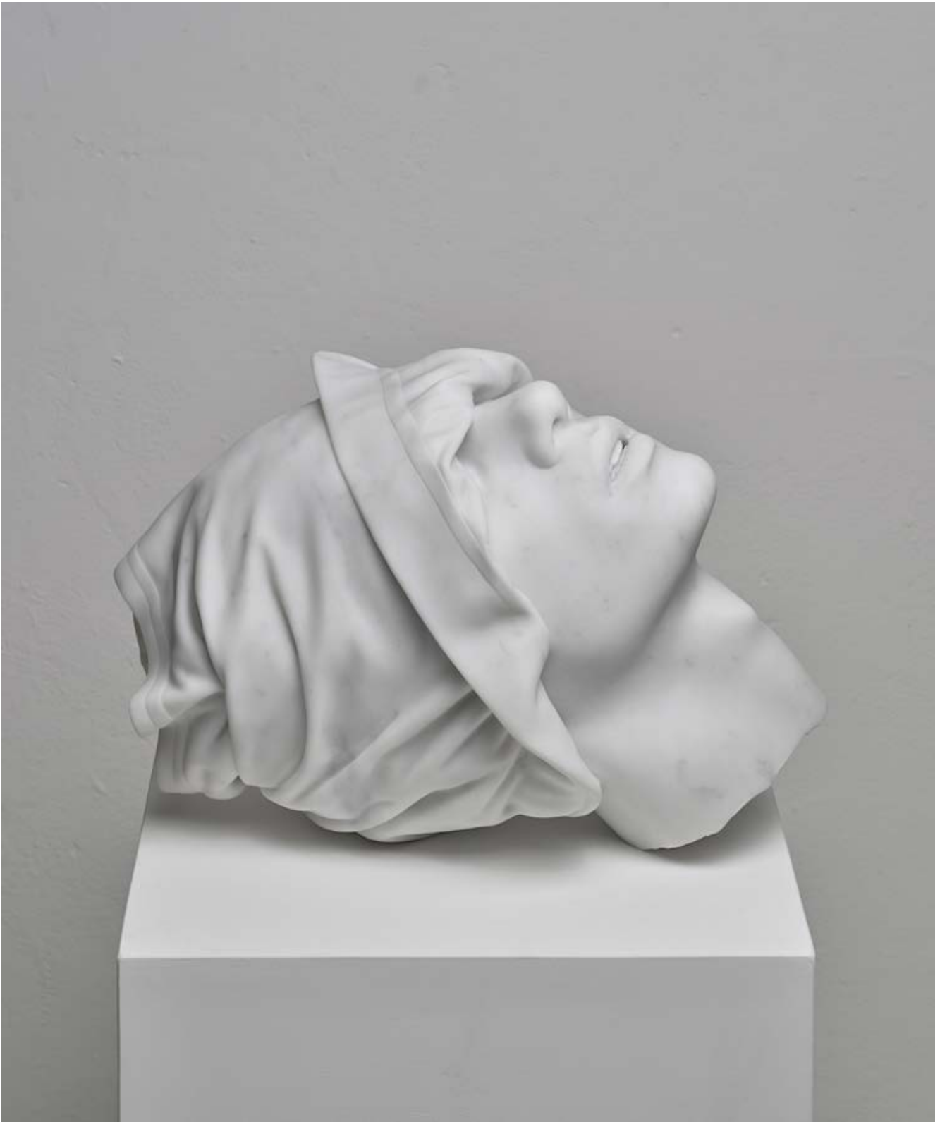
Reza Aramesh, Action 239: Study of the Head as Cultural Artefacts, 2023. Hand carved and polished Carrara marble. Dastan