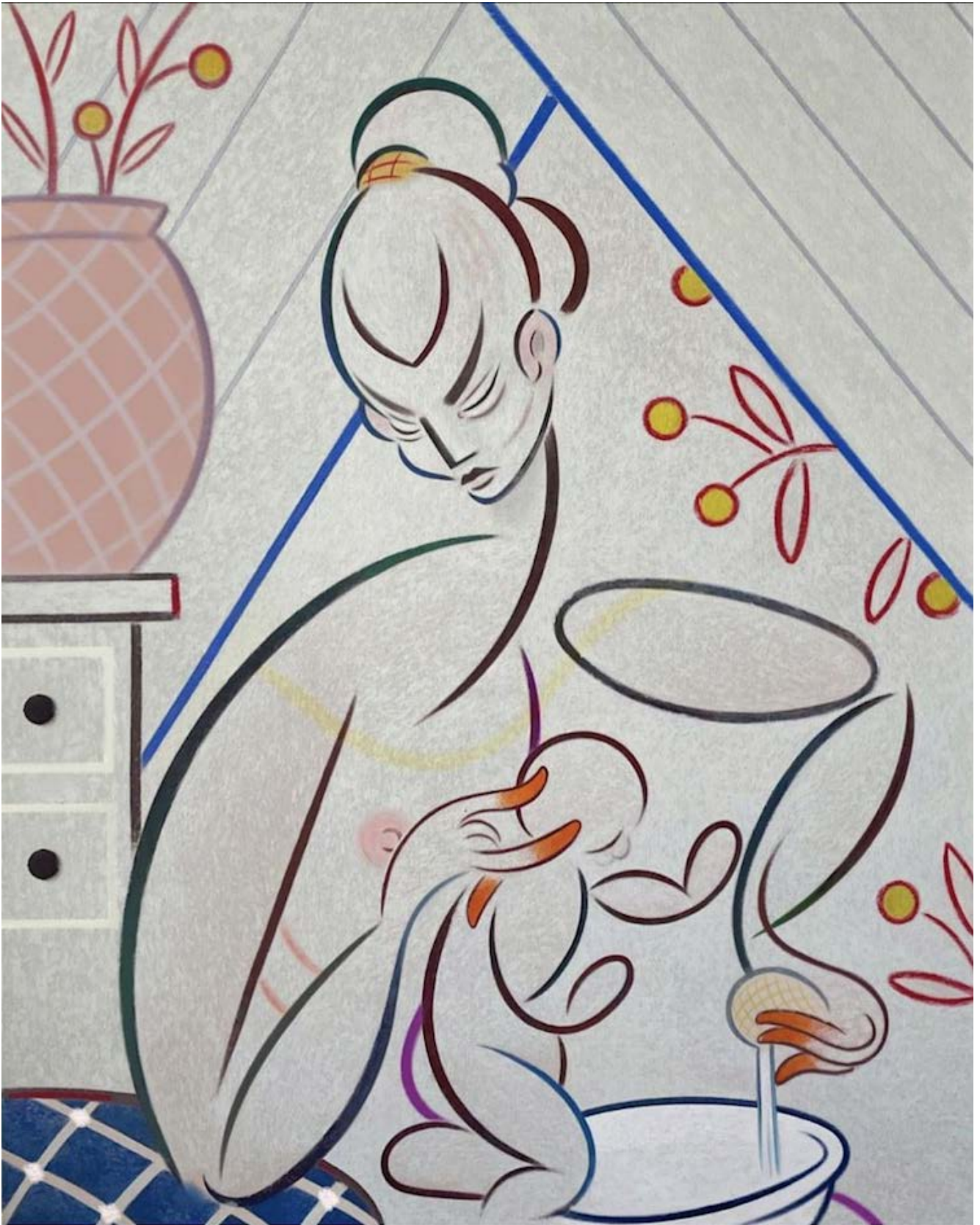
Koak, Date Night, 2023. Flashe and acrylic on canvas. Union Pacific