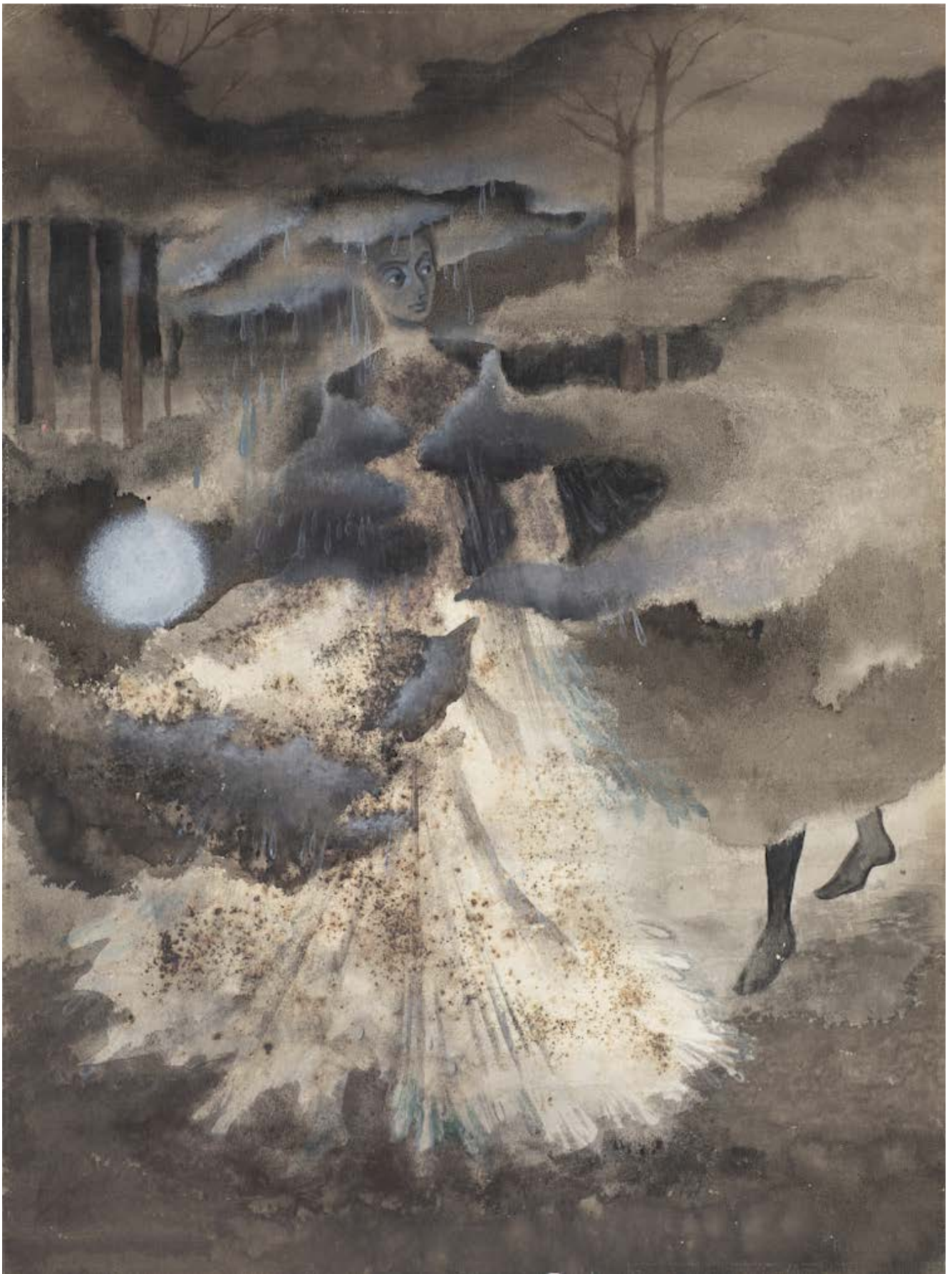
Remedios Varo, Apártalos que voy de paso , 1959. Gouache on Bristol board.