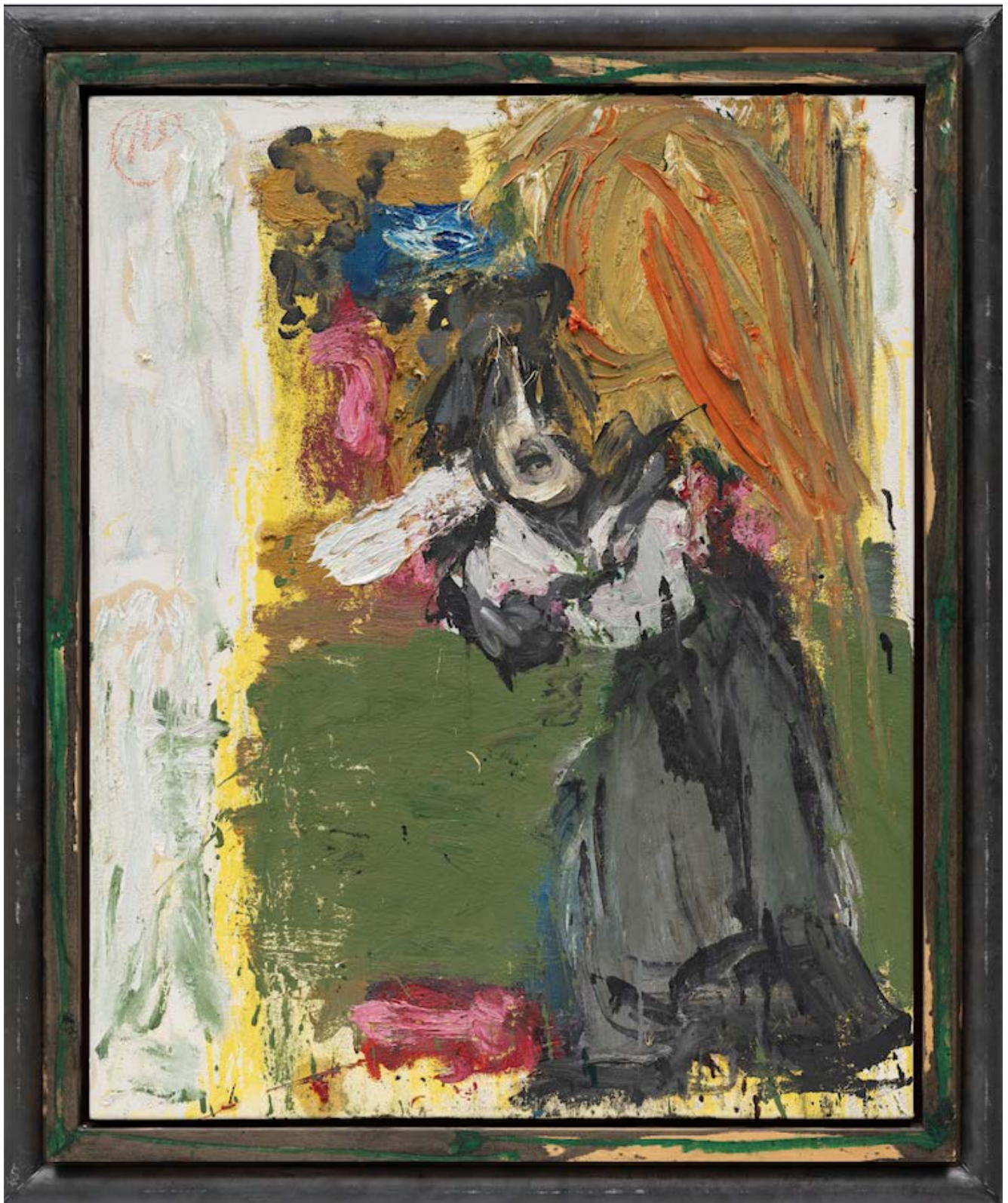
Markus Lüpertz, Nach Goya - Grauer Rock (After Goya – Gray Rock), 2002. Mixed media on canvas in artist's frame.