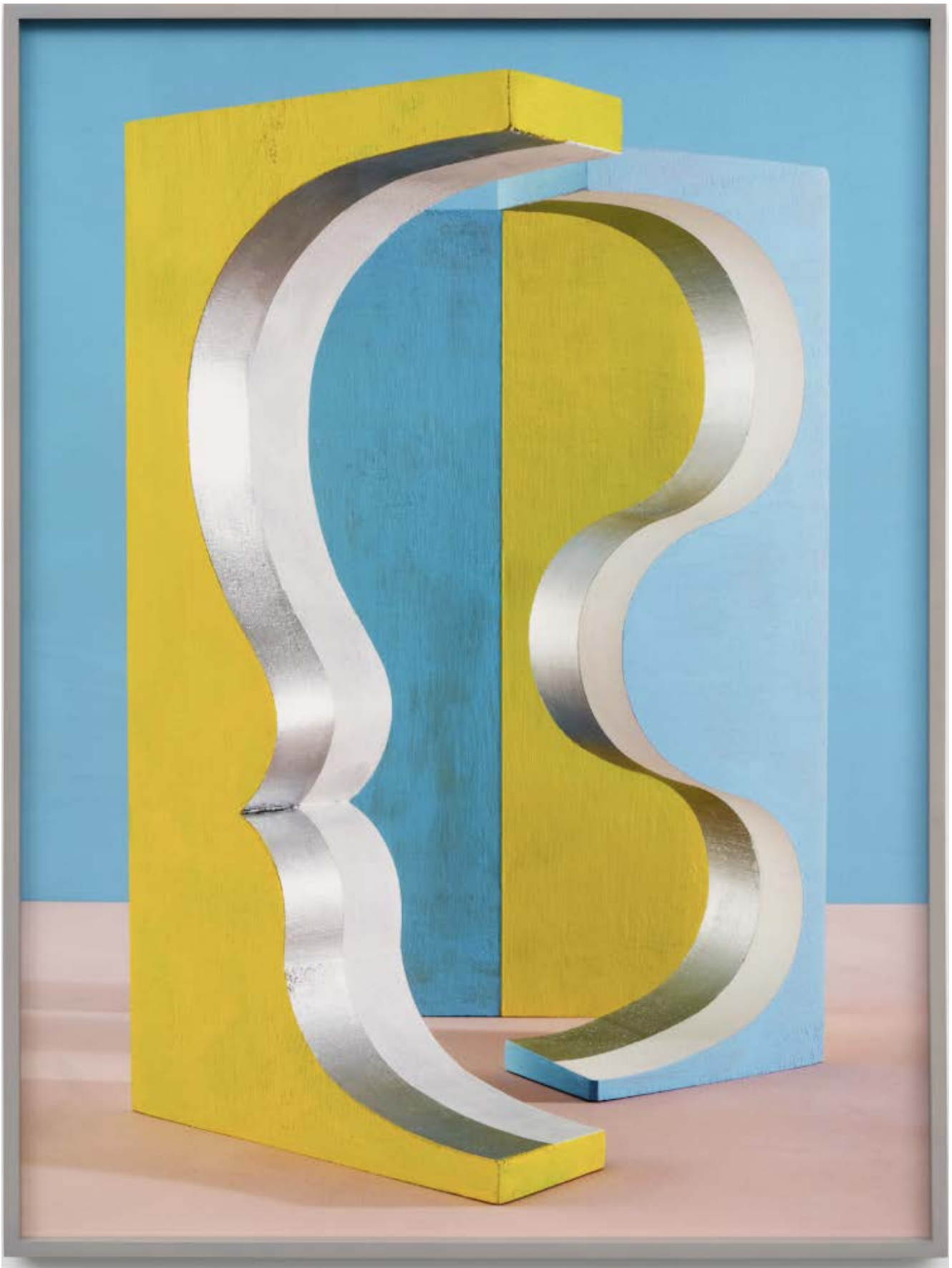
Erin O'Keefe, Silver Twist , 2023. Unique archival pigment print on Hahnemühle Photo Rag mounted to aluminium, framed. Seventeen