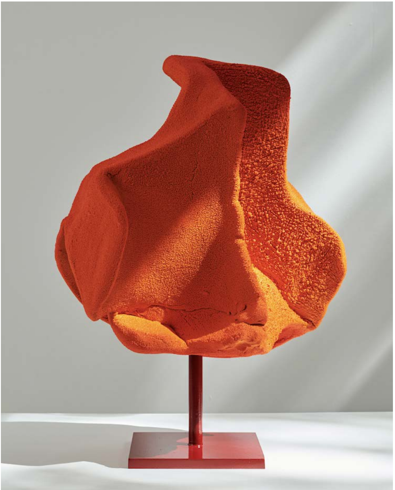
Arlene Shechet, Vernal Equinox: Together, 2023. Glazed ceramic, powder coated steel. Courtesy Pace