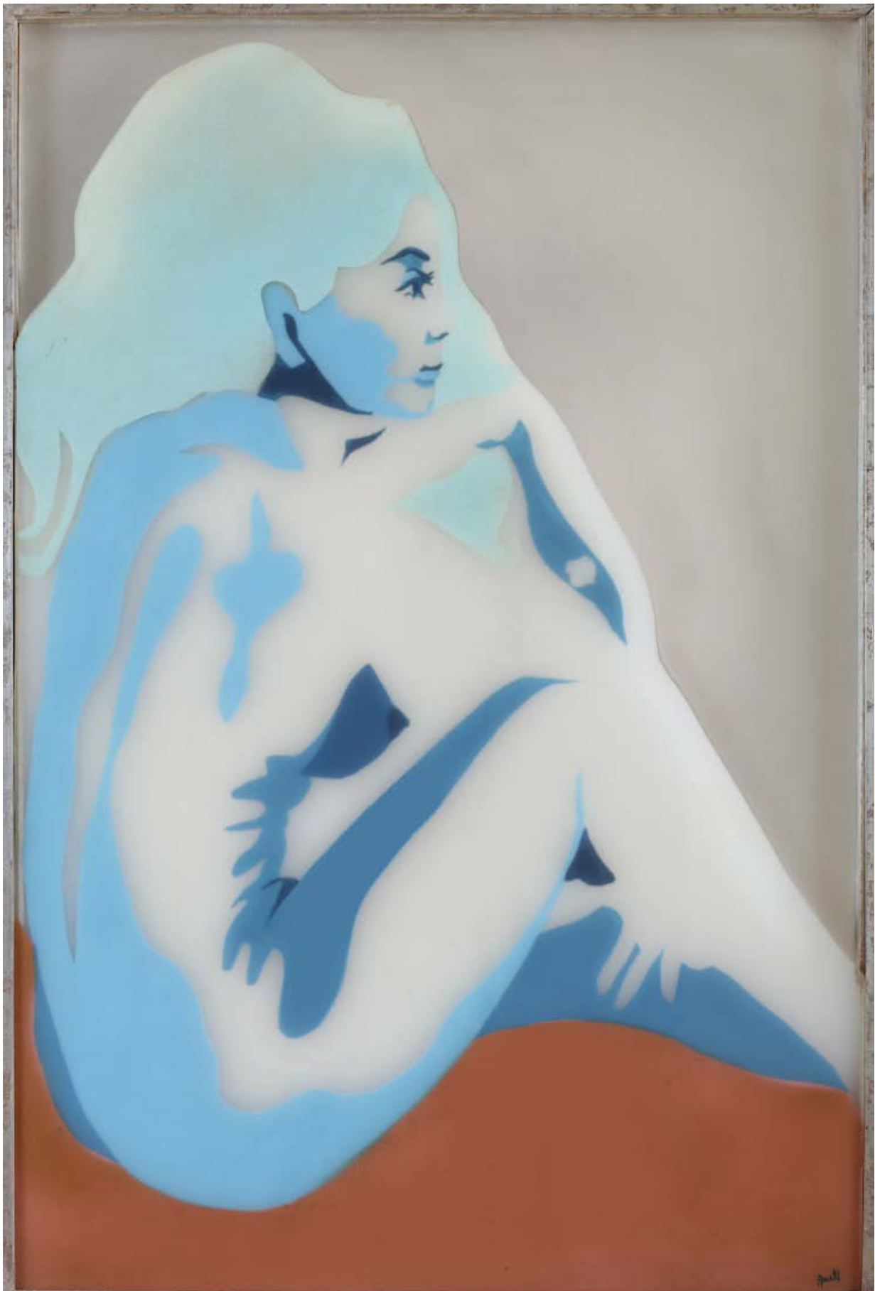
Evelyn Axell, Autoportrait, 1969. Enamel on plexiglass.