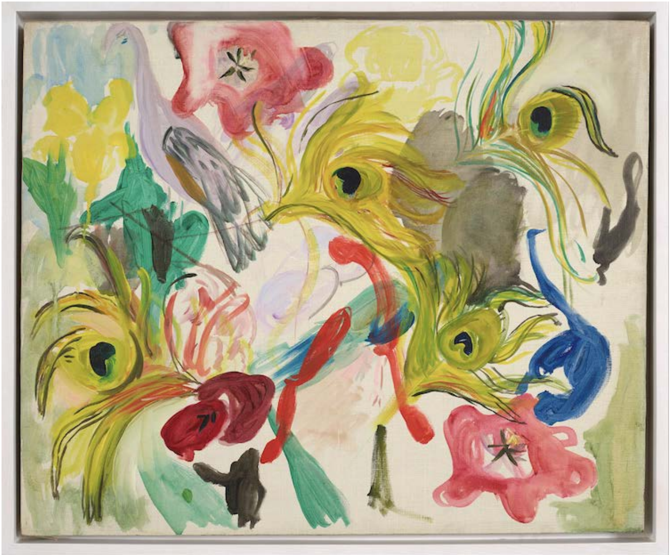
Ethel Schwabacher, Untitled, c. 1950. Oil on linen.