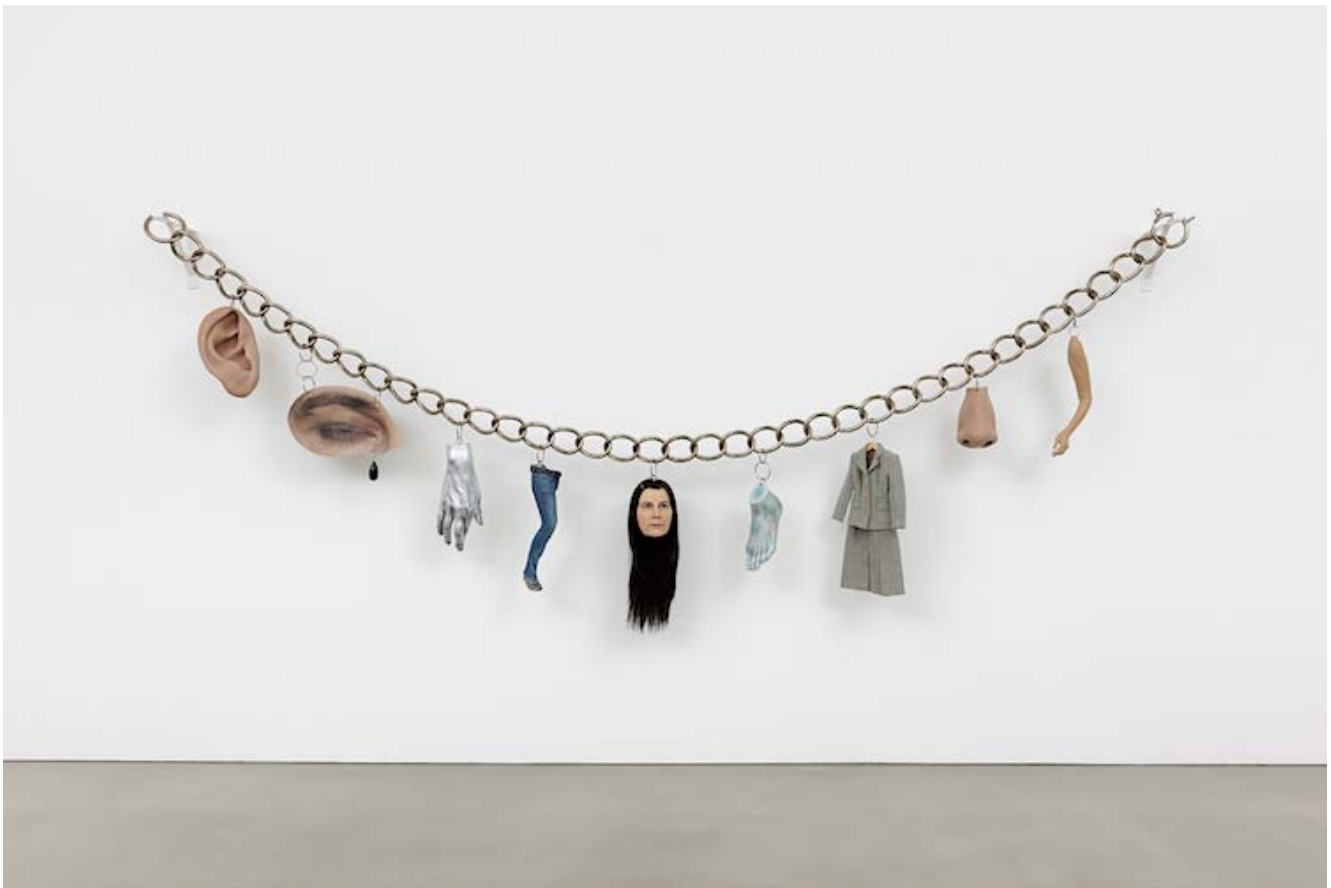
Gillian Wearing, My Charms , 2021. Bronze chain, 3D-printed objects, and mixed media. Courtesy Maureen Paley