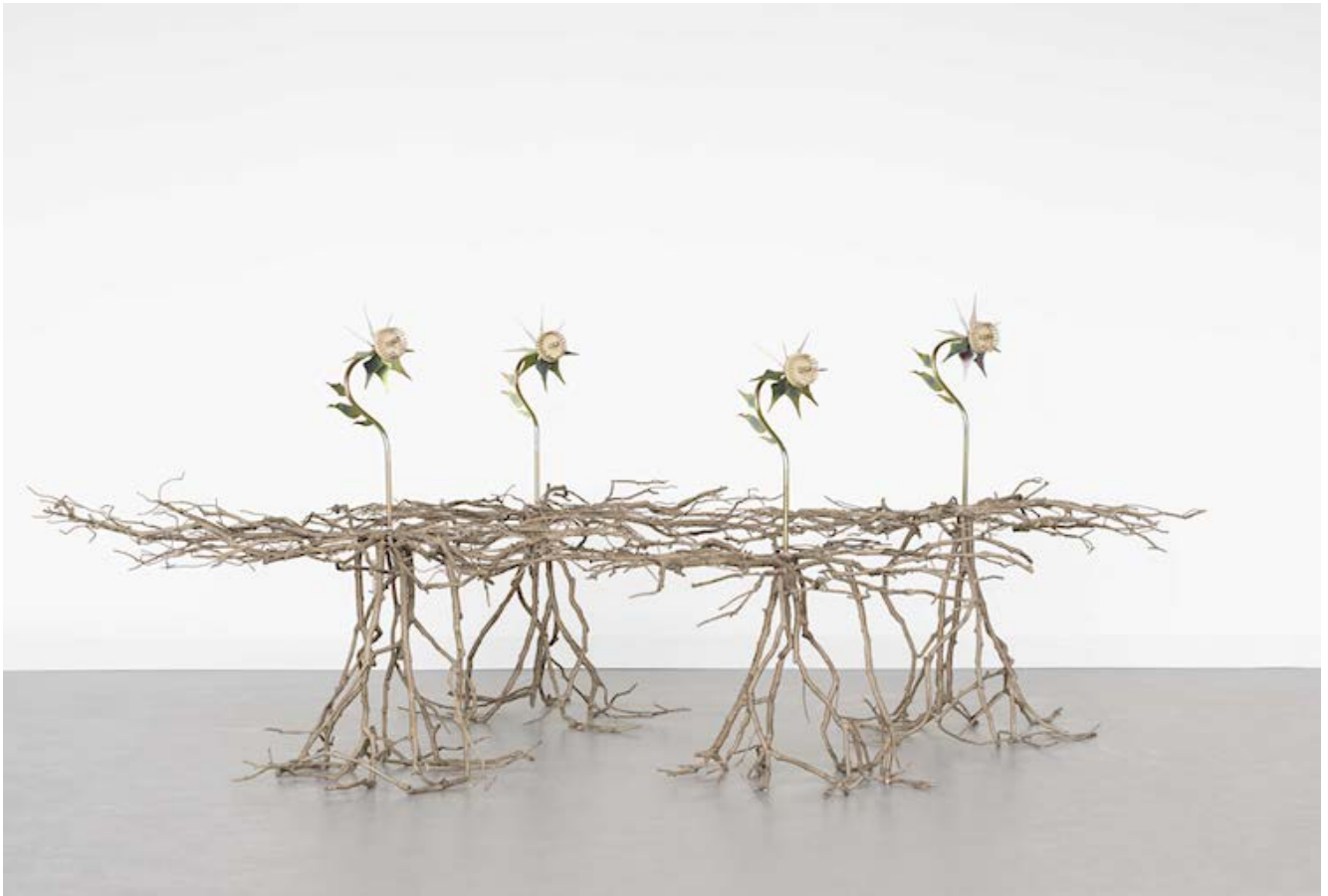
Marguerite Humeau, Russian Thistle Spins, 2023. Wind, zinc-passivated recycled steel, glass, hand-carved hardwood, bronze roots.