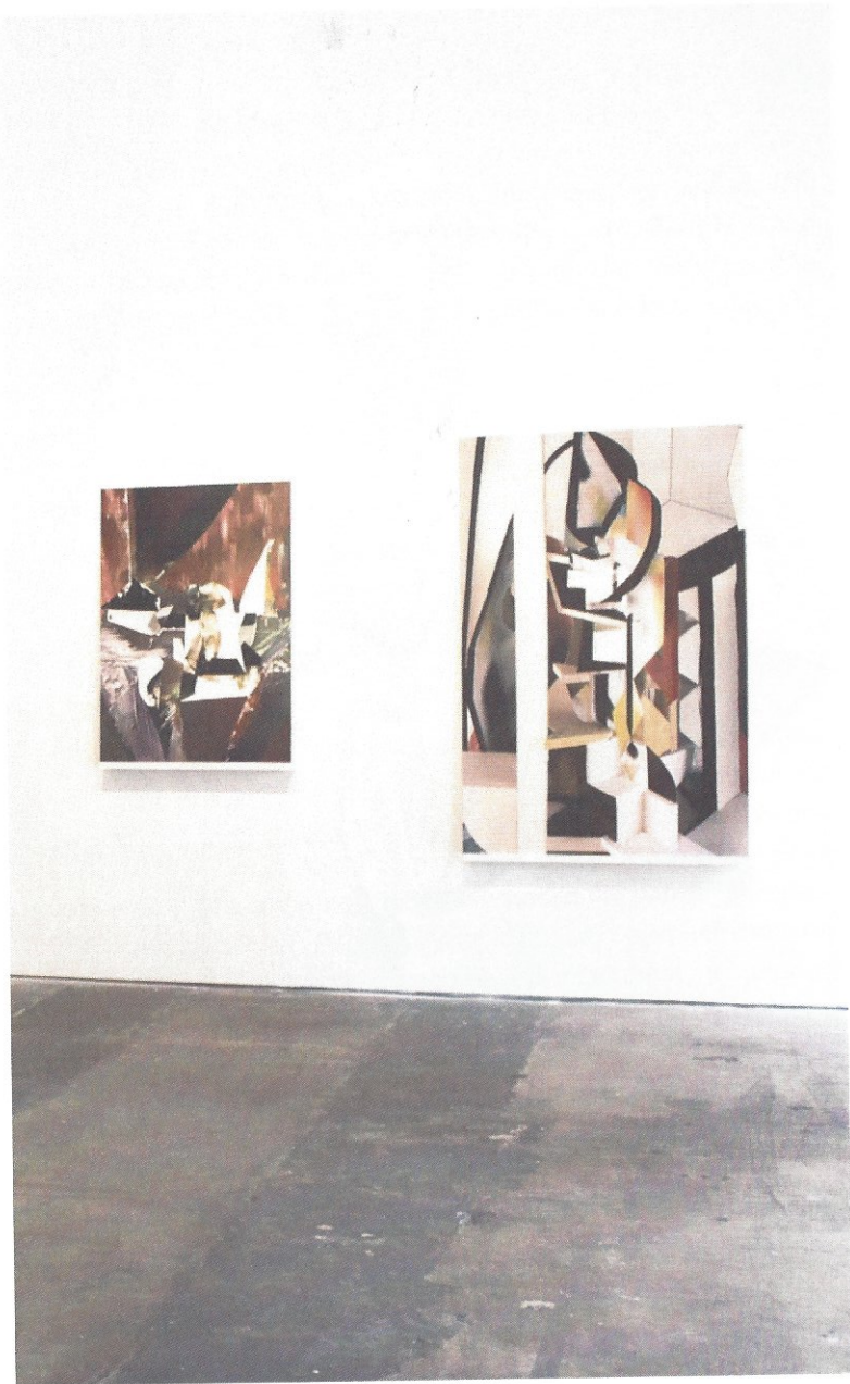
Works by Yamini Nayar in the New York-based Fridman Gallery's 'Aspirational Architectures' show in 2018.

and illegible. Much of my work considers the idea that a photograph doesn't have to reveal itself immediately, or even reveal all of itself.