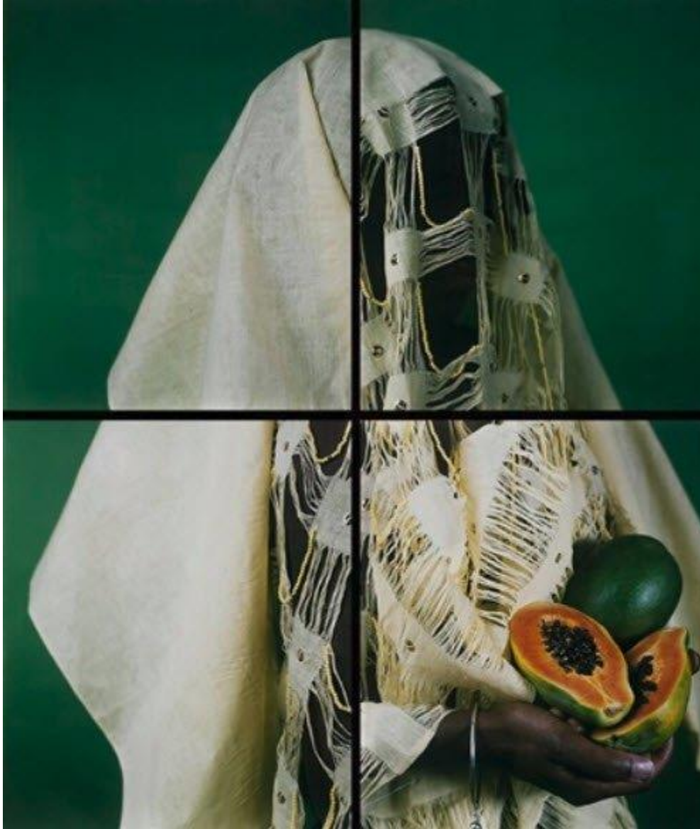
María Magdalena Campos-Pons, Bin Bin Lady, The Papaya (c. 2005).

Last week, our guide kicked off the New Year by focusing on what's going on in New York, so it's only appropriate that we follow it by checking in with the West Coast. Not to be overshadowed by Los Angeles, the evolving San Francisco art scene continues to put up