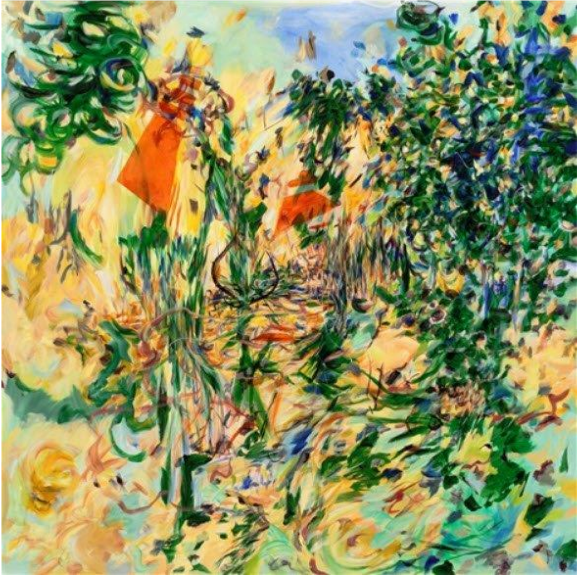
Naomie Kremer, Flying Jib (2017).

Exhibition: “Untold: Paintings & Hybrids”