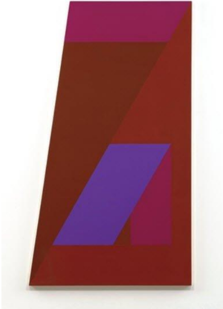
Leo Valledor, A New Slant (1981).