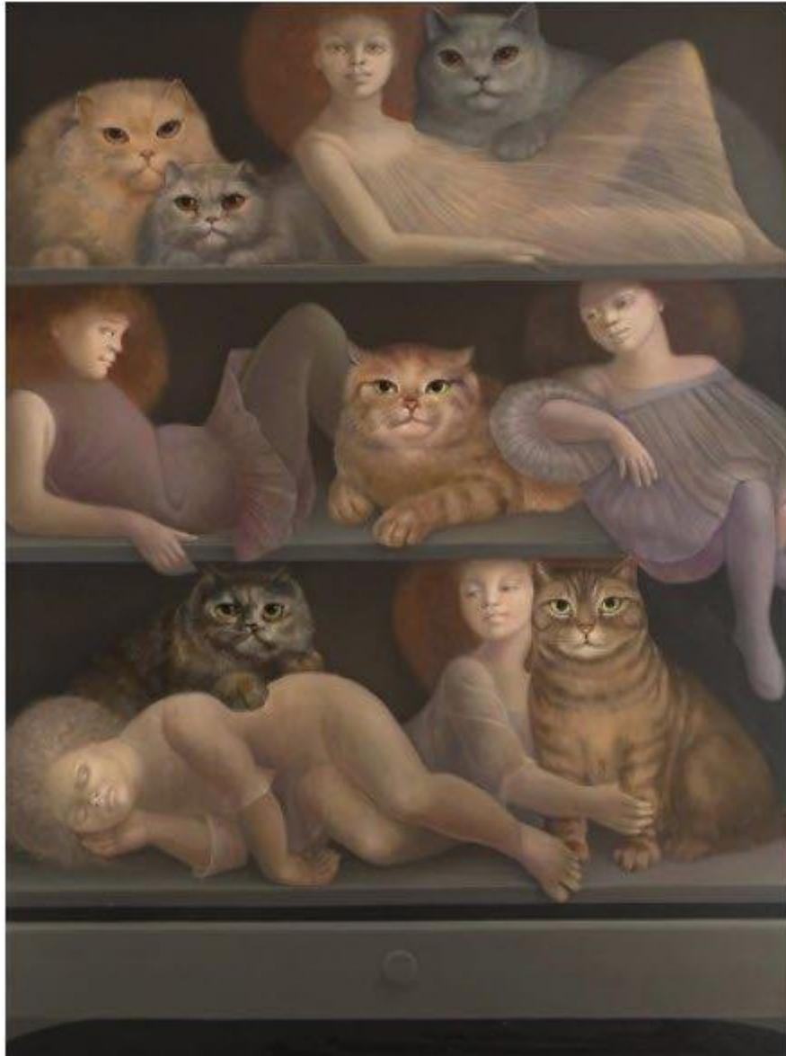
Leonor Fini, Dimanche Apres-midi (1980).