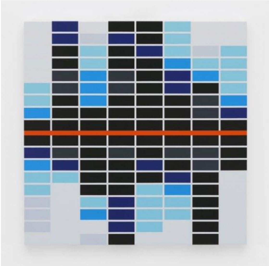
Sarah Morris, Sound Graph 2 (2017).